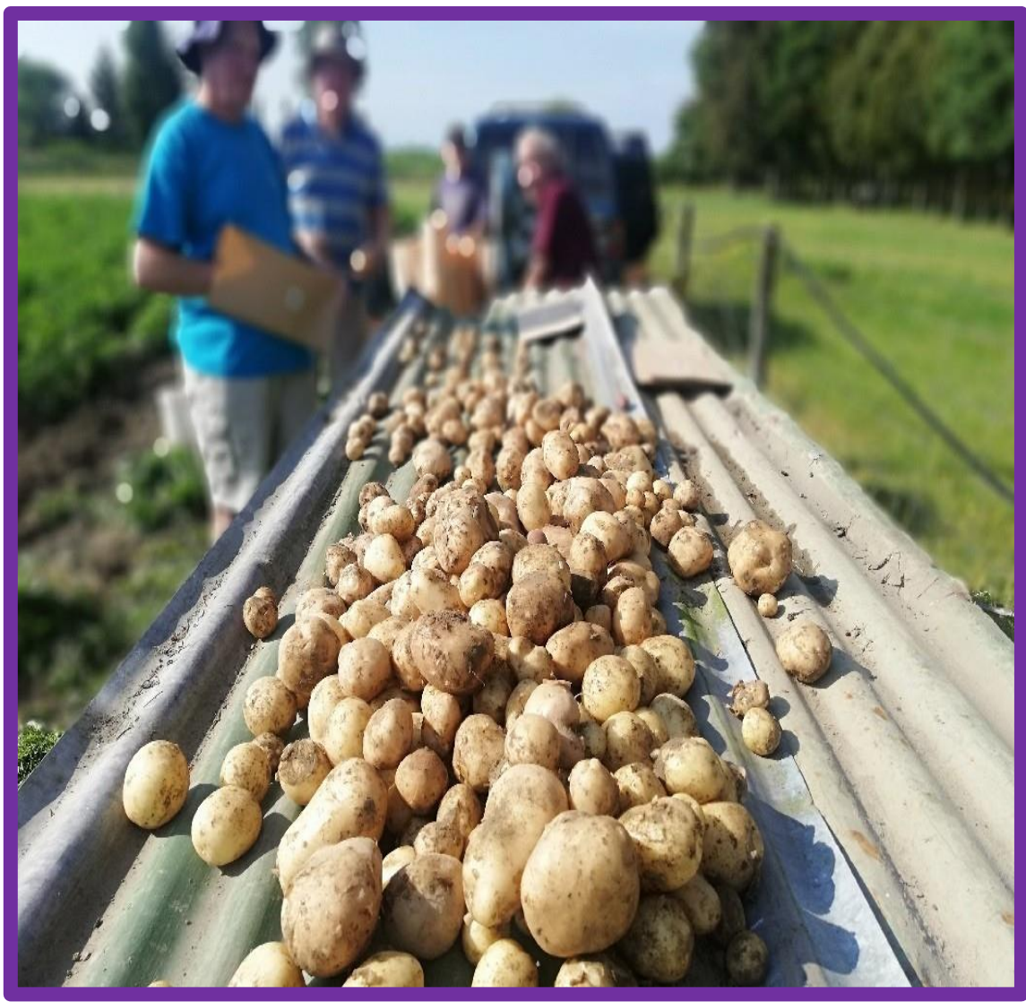
Motueka Lions Spuds