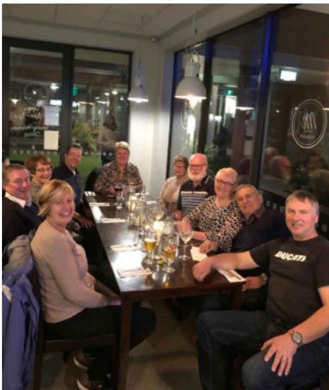
Dinner on arrival at Hanmer