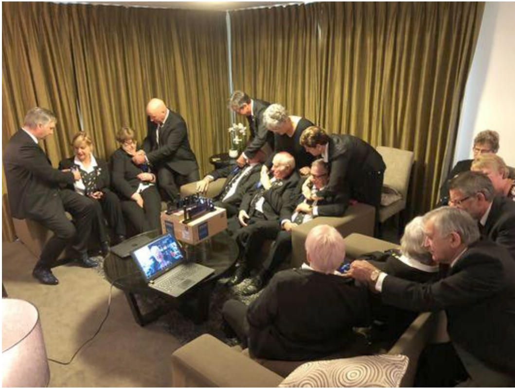
Removing the blue District Governor Elect ribbon / adding the District Governor badge