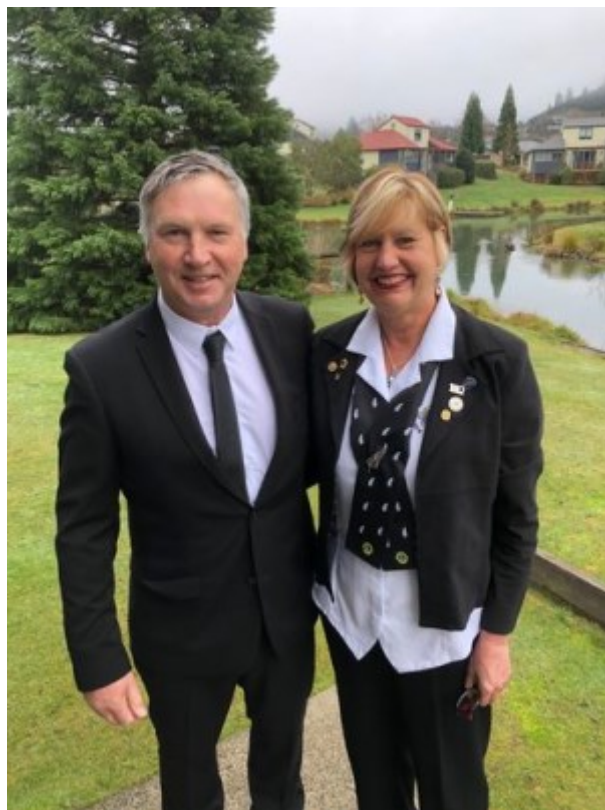
The induction ceremony is soon to begin