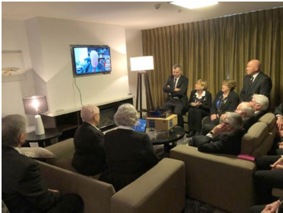
The induction ceremony has begun