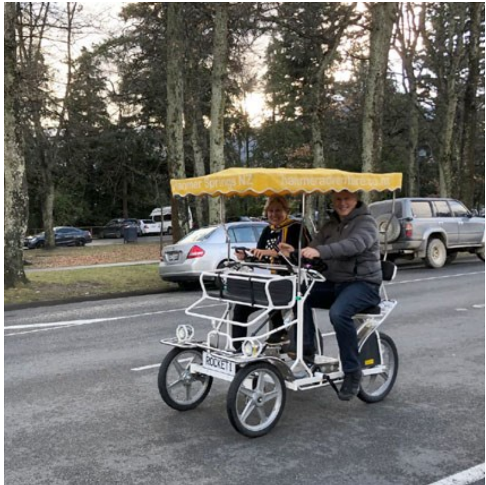
An afternoon jaunt around Hanmer