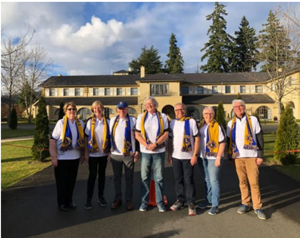
Still able to stand after all that peddling