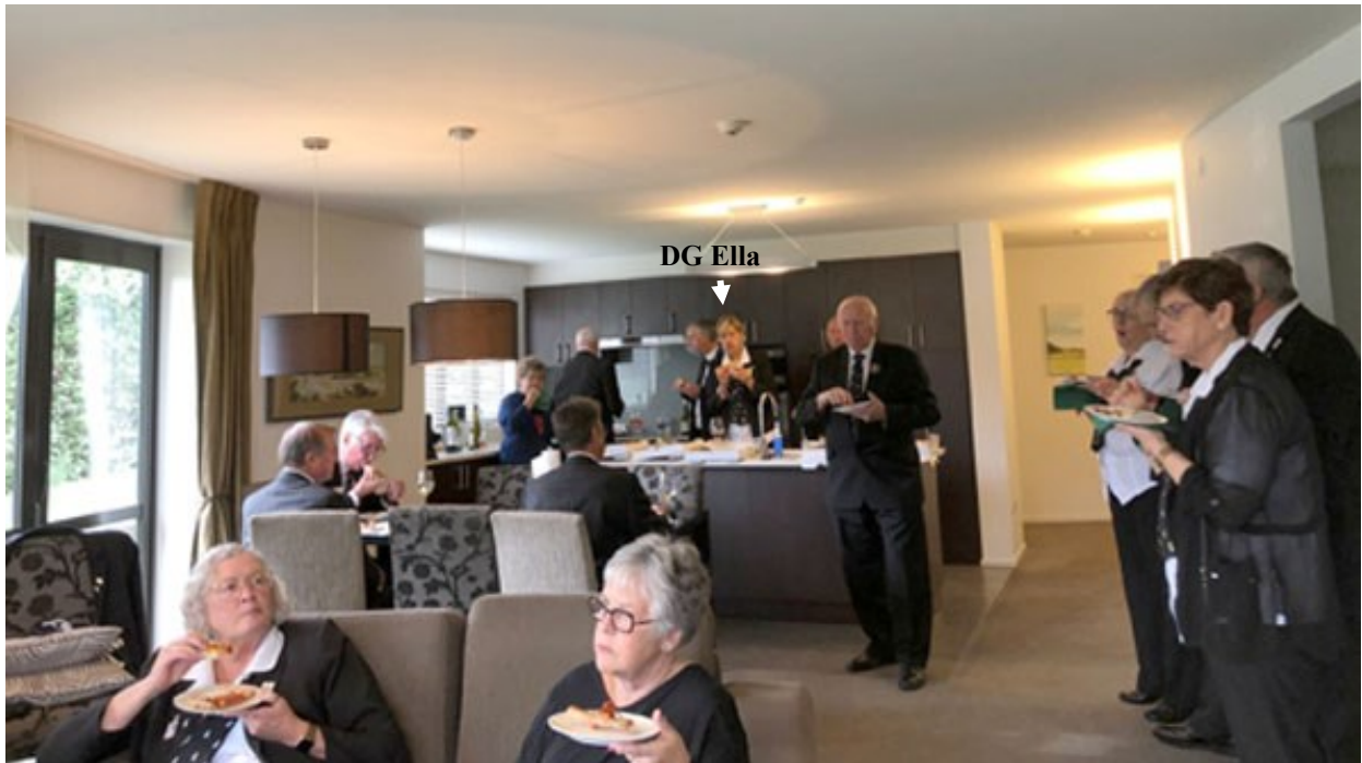
The morning's activities worked up an appetite - devouring scrummy pizza