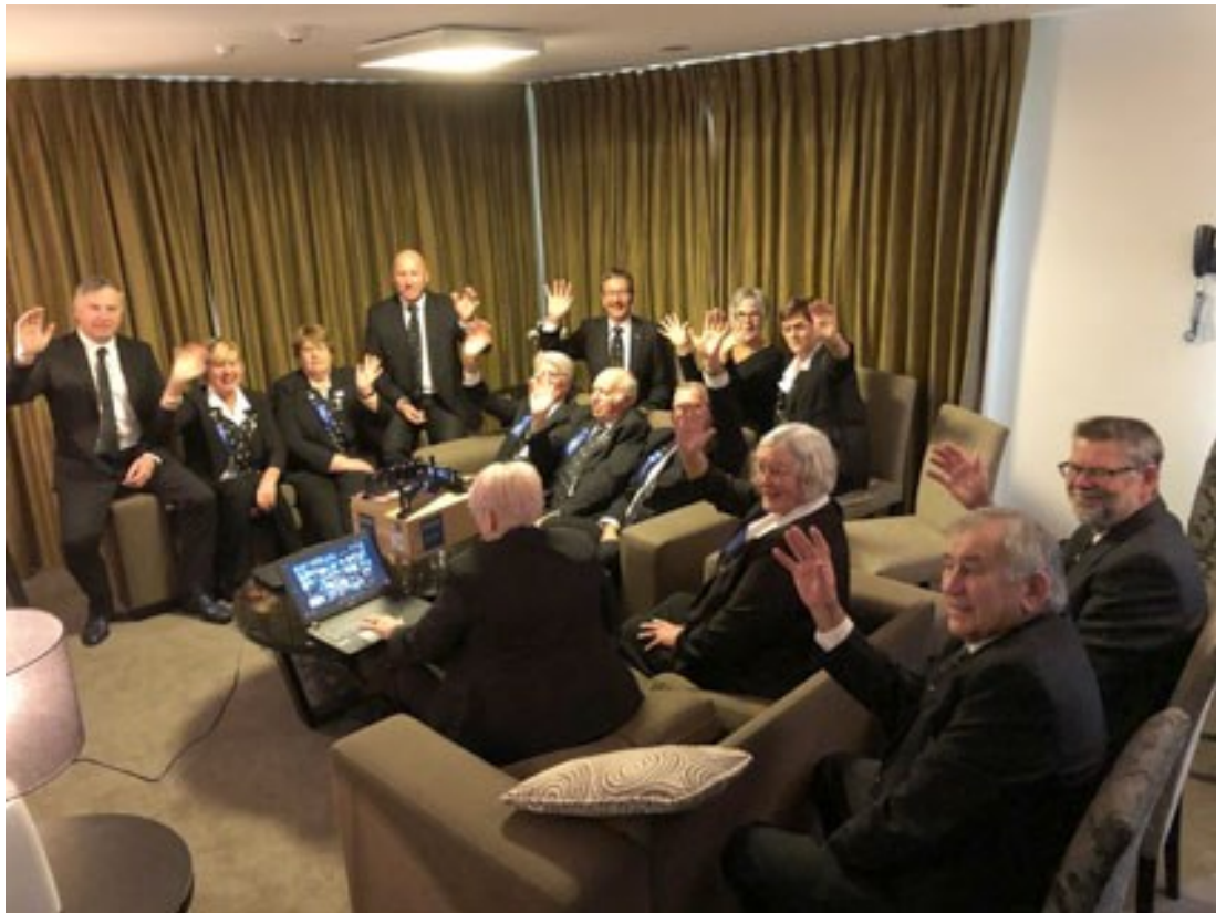
Waiting for Zoom to commence Sunday 28 June