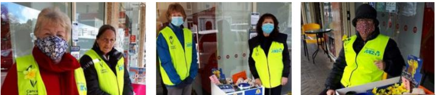
Palmerston North Heartland Lions collecting for Daffodil Day.

Cancer hasn't stopped for COVID and neither has the Cancer Society. Right through lockdown, the Charity continued providing practical and emotional support to families living with cancer. Daffodil Day is crucial to funding the charity's work providing free support services, including transport to hospital appointments, the shuttle service to treatment in Palmerston North, counselling, advocacy and therapeutic massage, as well as cancer prevention awareness and education programs and funding research into the causes and treatment of cancer. The Daffodil Day Street Appeal went ahead across the country (except Auckland) despite being in Level 2. Although cancelled in Auckland, planning for street collections under alert level 2 continued in our district, but with precautions in place. Contactless donations encouraged; physical distancing required; friendly smiles frequently hidden behind face masks. Daffodil Day may have looked different this year, but the hard work of our area coordinators and their teams of dedicated volunteers in towns across the district was no less significant; the support of the community no less vital. (NZ Herald)