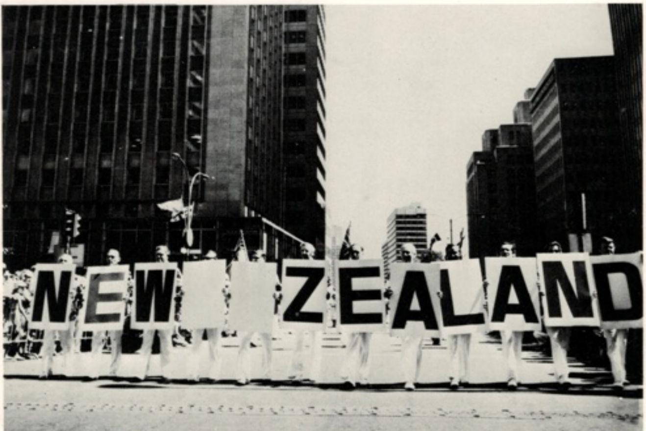
The contingent of Multiple District 202 winning the International Parade Contest.